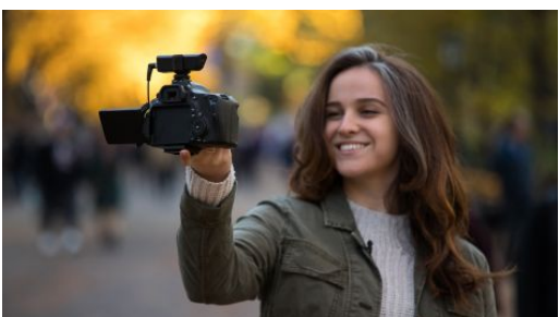
Make music and get creative with XS Wireless Digital

Special anniversary offers on the Vocal, Lavalier, Pedalboard and Portable Lavalier Sets