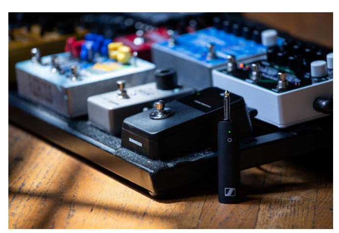
The XSW-D Pedalboard Set features a built-in guitar tuner

The images accompanying this press release plus additional images can be downloaded at <a href="https://sennheiser-brandzone.com/c/181/ArdjUrTF">https://sennheiser-brandzone.com/c/181/ArdjUrTF</a>.